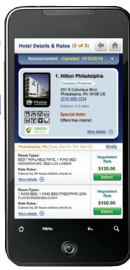
GetThere Mobile on Android