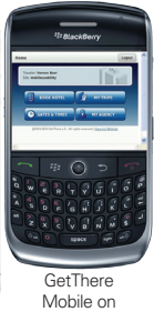
GetThere Mobile on BlackBerry